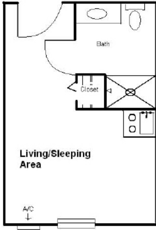
Typical 4th Floor Unit

There is a small refrigerator w/ freezer and a sink; the stove top is not connected.